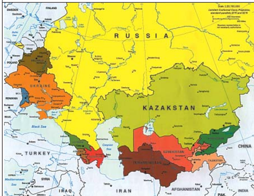
POLITICAL MAP OF THE COMMONWEALTH OF INDEPENDENT STATES, 1997

Locate the Central Asian Republics on the map.