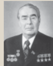
Leonid Brezhnev (1906-82) Leader of the Soviet Union (1964-82); proposed Asian Collective Security system; associated with the détente phase in relations with the US; involved in suppressing a popular rebellion in Czechoslovakia and in invading Afghanistan.