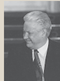
Boris Yeltsin (Born 1931)

The first elected President of Russia (1991-1999); rose to power in the Communist Party and was made the Mayor of Moscow by Gorbachev; later joined the critics of Gorbachev and left the Communist Party; led the protests against the Soviet regime in 1991; played a key role in dissolving the Soviet Union; blamed for hardships suffered by Russians in their transition from communism to capitalism.