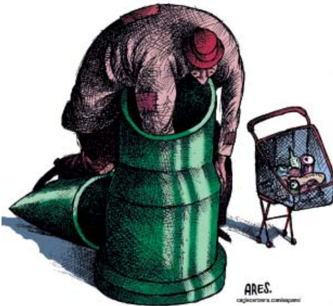
Third World Arms