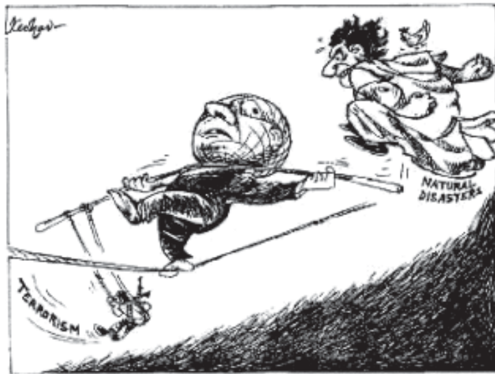
Keshav, The Hindu

Expansion of the concept of security does not mean that we can include any kind of disease or distress in the ambit of security. If we do that, the concept of security stands to lose its coherence. Everything could become a security issue. To qualify