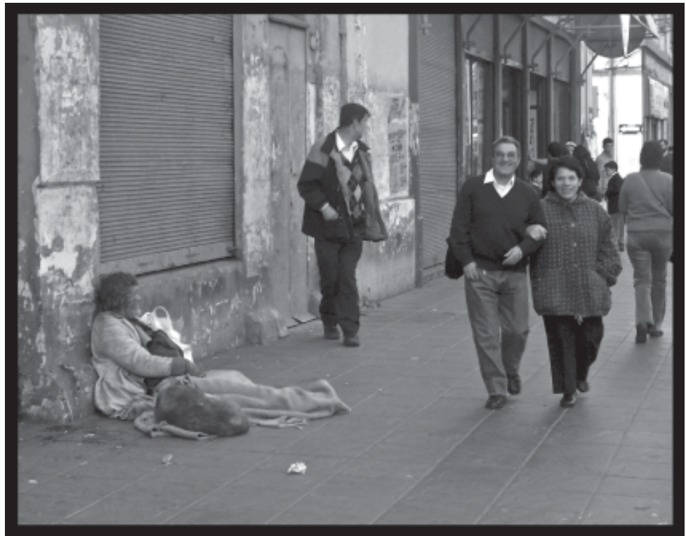
He doesn't exist!

Why do we always look outside when talking about human rights violations? Don't we have examples from our own country?