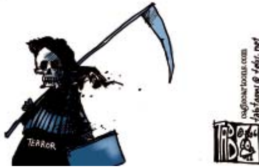
Taking the train